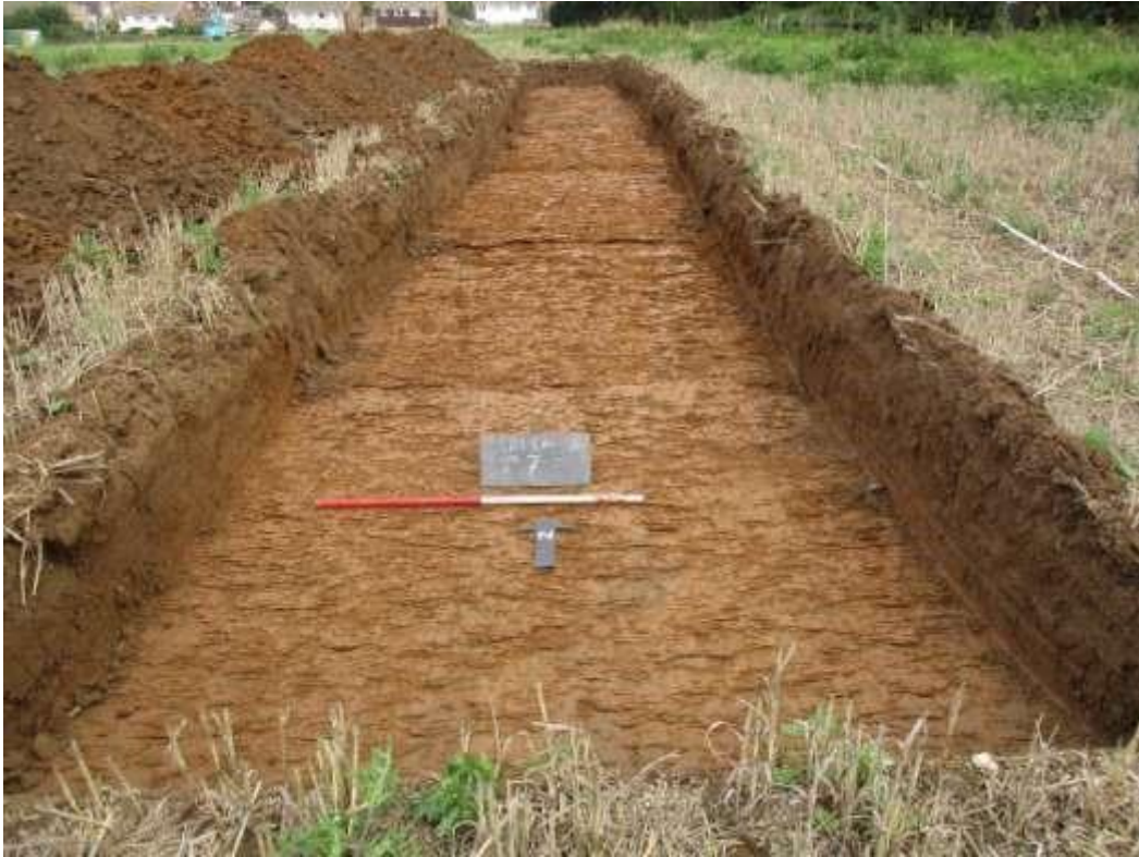
Plate 7; Trench 7 looking north (one-metre scale)