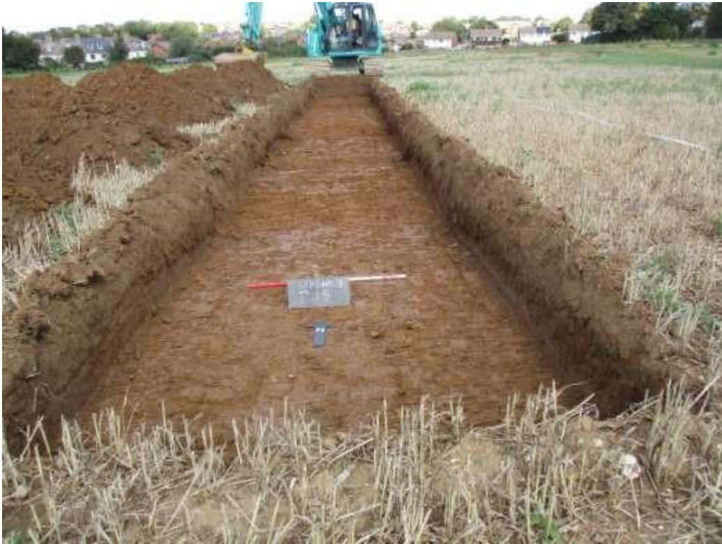
Plate 11: Trench 15 (shown as Trench 16 on the trench plan) looking north (one-metre scale)