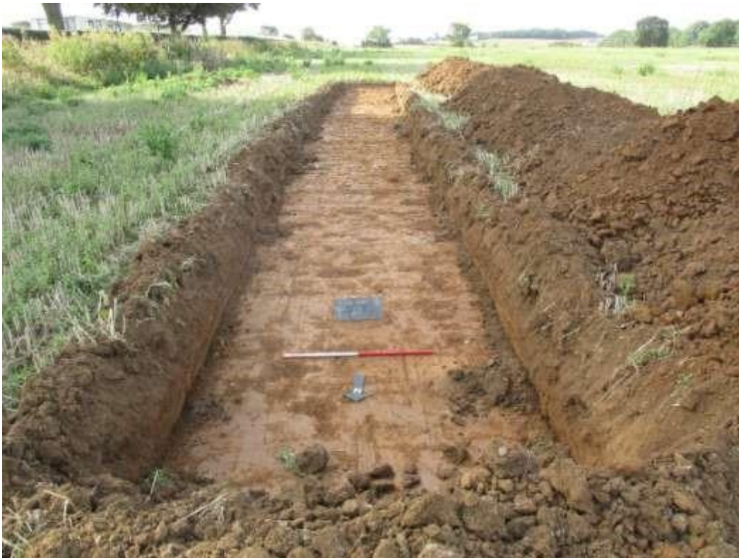
Plate 16: Trench 21 looking south (one-metre scale)