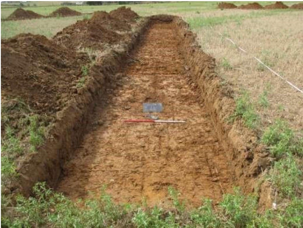
Plate 18: Trench 24 looking south-east (one-metre scale)