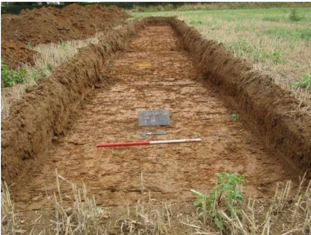
Plate 10: Trench 12 looking east (one-metre scale)