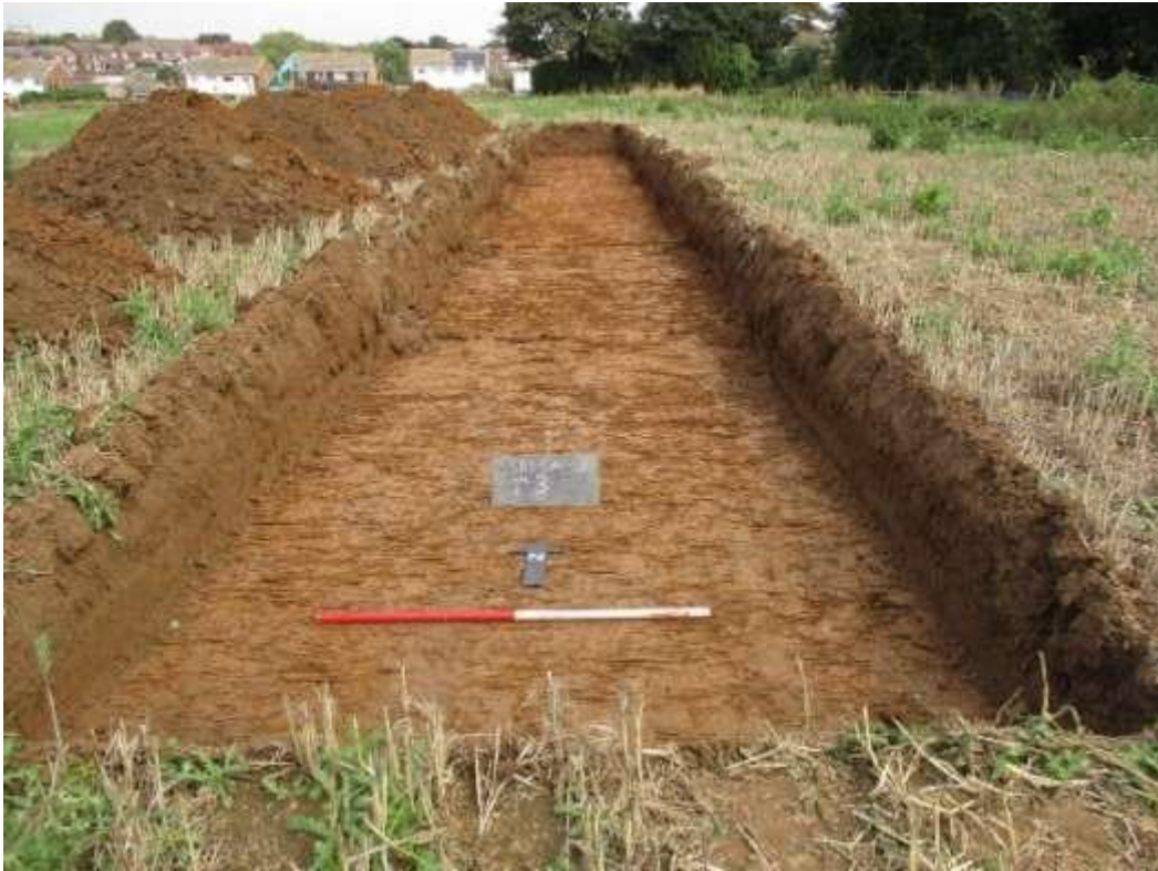
Plate 3: Trench 3 looking north (one-metre scale)