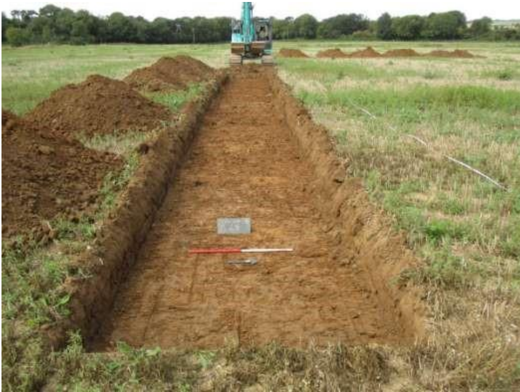
Plate 19: Trench 25 looking west (one-metre scale)