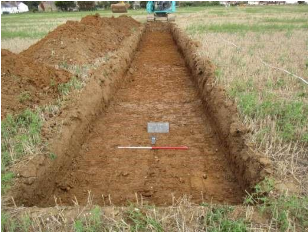
Plate 17: Trench 23 looking north (one-metre scale)