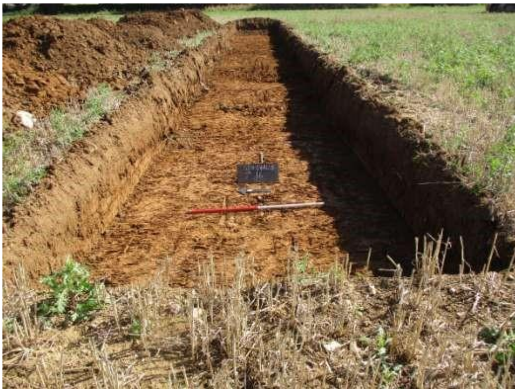
Plate 12: Trench 16 (shown as Trench 15 on the trench plan) looking west (one-metre scale)