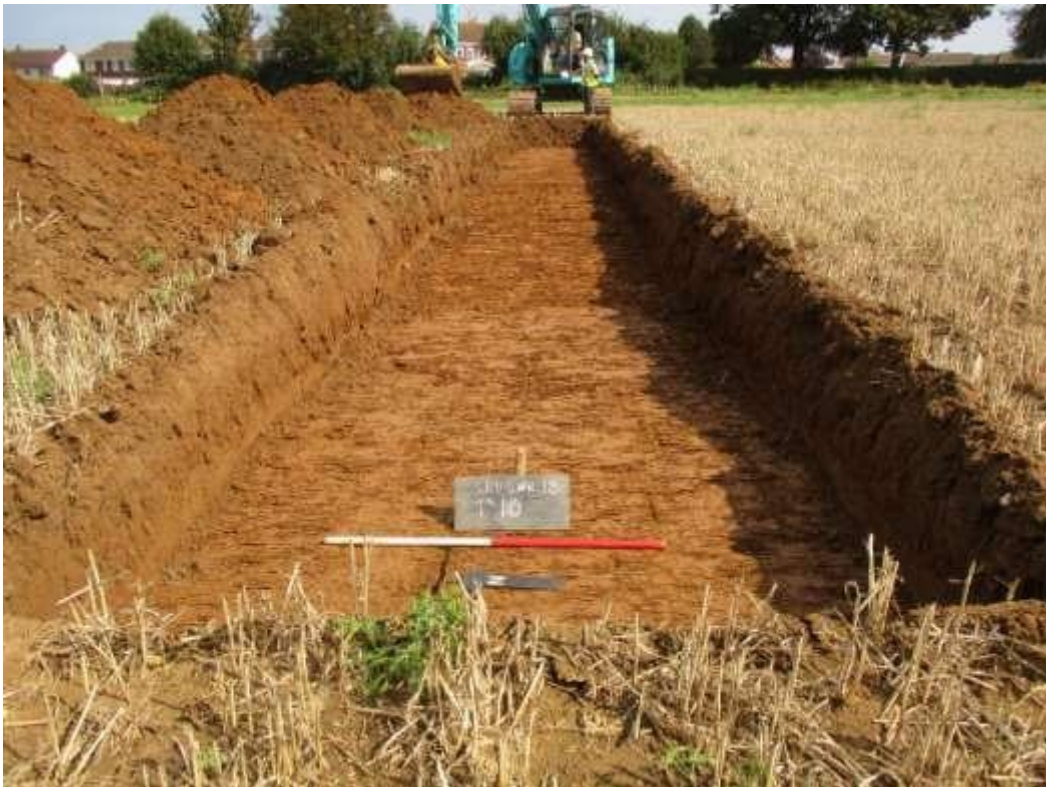
Plate 8: Trench 10 looking east (one-metre scale)