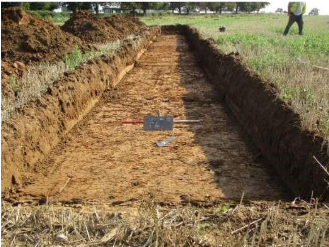
Plate 4: Trench 4 looking south-east (one-metre scale)