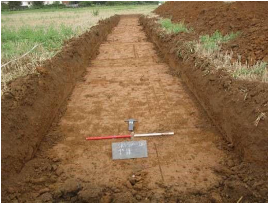
Plate 9: Trench 11 looking north (one-metre scale)