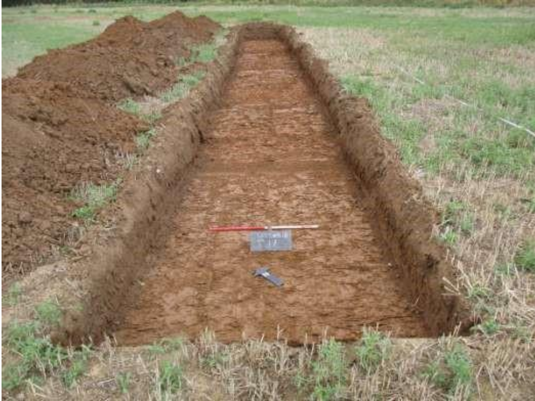
Plate 13: Trench 17 looking north-east (one-metre scale)