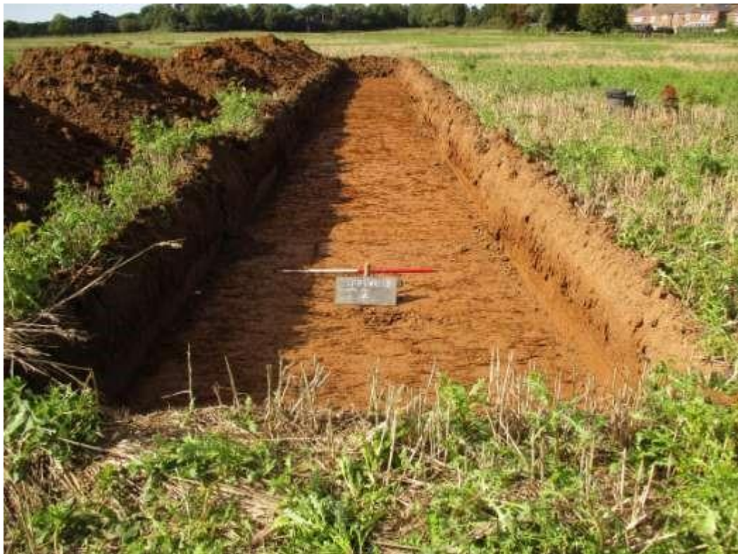
Plate 2: Trench 2 looking south-west (one-metre scale)