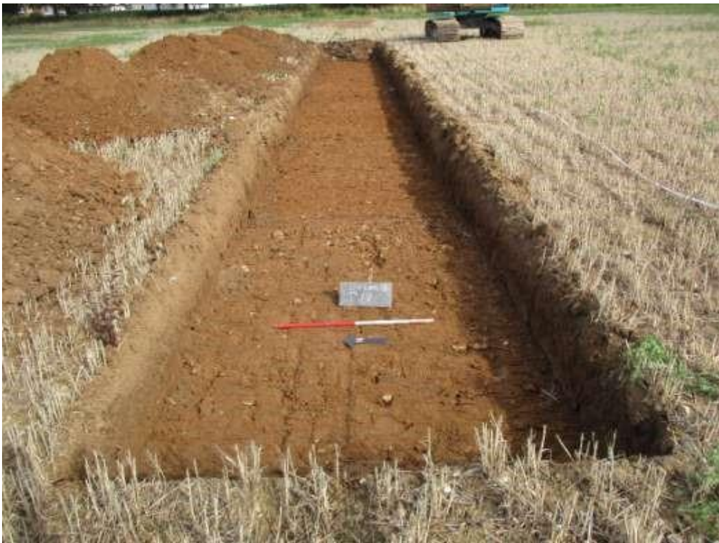
Plate 14: Trench 19 looking east (one-metre scale)