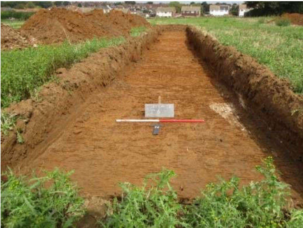
Plate 6; Trench 6 looking north showing modern chalk-filled pit to the left (east), one-metre scale