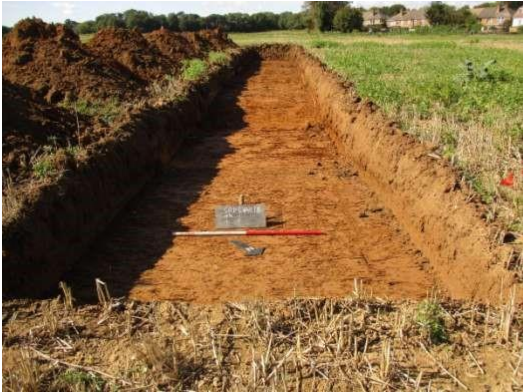
Plate 1: Trench 1 looking south-west (one-metre scale)