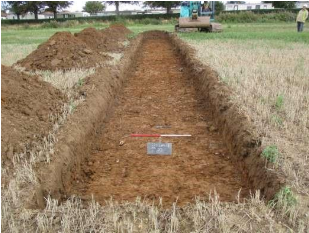
Plate 15: Trench 20 looking east (one-metre scale)