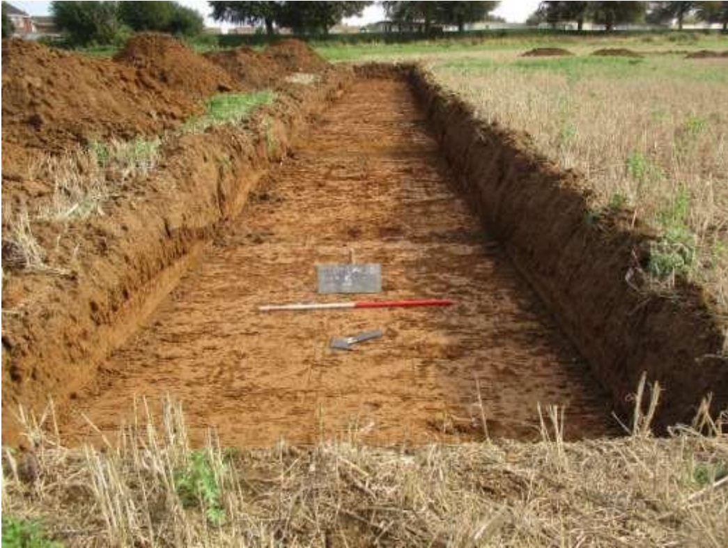
Plate 5: Trench 5 looking south-east (one-metre scale)